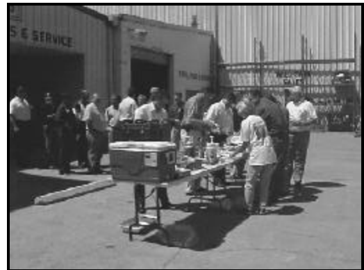
Everyone lining up for some good food