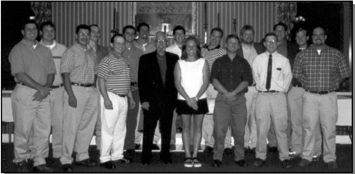
The 2002 Mid-South IEC Apprenticeship graduating class

On June 4th at the Germantown Country Club over 125 friends, family, employers and employees gather to celebrate the 4th Year IEC Apprenticeship Graduation. This graduation was the largest attended graduation the IEC has ever experienced. The support that everyone showed to these future Journeymen...er...ah...Journeypersons, was second to none. During the evening, a great deal of pride was felt not only from the graduates, but from those that the graduates work with.