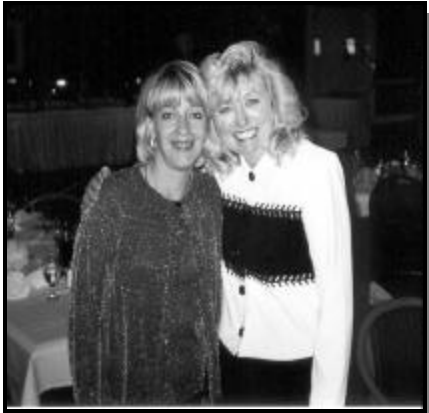
Santa is stilling thinking about these two ladies being GOOD or BAD this year.....

Our Annual Christmas was held at the Germantown Country Club on December 11. We played "Take a Present Home" game where you have a chance of taking someone else's gift away from them. Great time was had by all!!