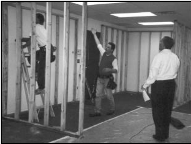
Framing in the lab positions

Within the same square footage we currently have, we were able to build an Electrical Lab with 9 positions that can comfortably host up to 20 students at a time. Also, we were able to build 2 additional lab positions that BICSI requires for us to have for the upcoming VDV (Voice, Data and Video) Apprenticeship training. We are looking to start this VDV program this August.